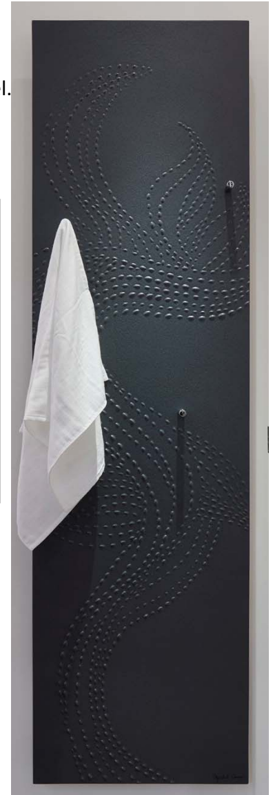
Flower Water Towel Warmer 73" / 185cm tall 20" / 50cm wide Also available in 78-3/4" / 200cm high. 24" / 60cm wide.

Hydronic energy output: 73" tall: 803W-2742Btu. 79" tall: 1027W-3507Btu.